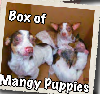
Box of Mangy Puppies