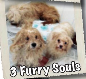
3 Furry Souls