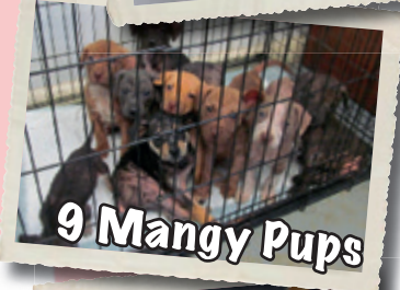
9 Mangy Pups