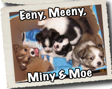
Eeny, Meeny, Miny & Moe

treated her for mange, and fattened her up with chicken, weenies, and dog food, she went to Wisconsin where she is now part of a wonderful family who loves her. A lady driving down Rodd Field saw this pool on the side of the road with 17 puppies in it. Some had crawled out and were going toward the road. They were scared but after treatment for parasites, some good food, and love, they all survived and went to Michigan to find happy futures where they will be appreciated and loved.