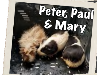
Peter, Paul & Mary