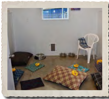
1 of the 5 rooms in Harley's Special Place

1307 Saratoga Corpus Christi, Texas 78417