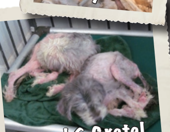
Hansel & Gretel