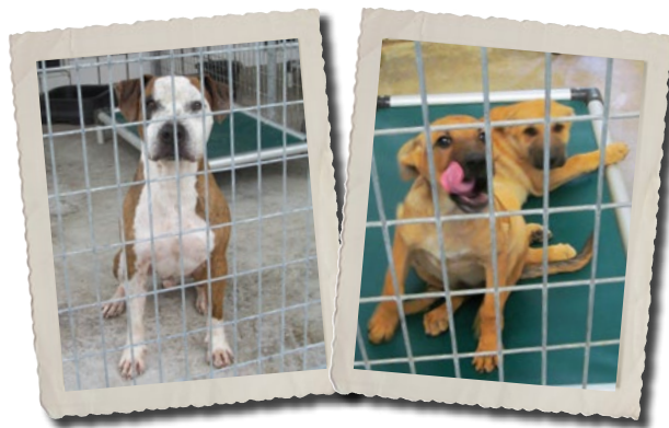
Hanging out in comfort at Lucky Lodge, waiting for you.

1307 Saratoga Corpus Christi, Texas 78417