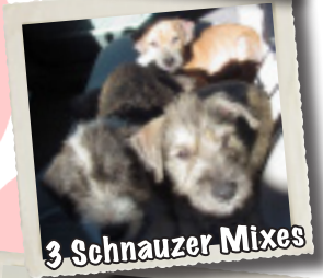
3 Schnauzer Mixes