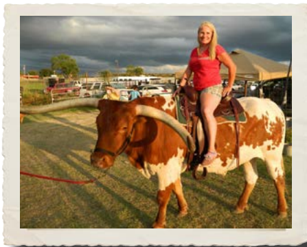
Lonestar, the Volunteer Steer

1307 Saratoga Corpus Christi, Texas 78417